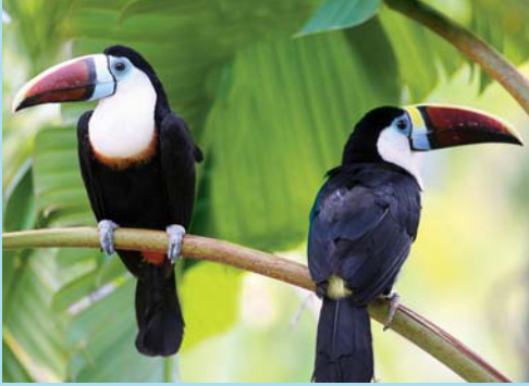
The white-throated toucan's exuberant call is one of the most characteristic sounds of the lowland forest.

Depart for the cosmopolitan coastal city of Lima, Peru, located at the foot of the Andes Mountains, and arrive late today. In the heart of the upscale, cultural Miraflores district, check into the deluxe CASA ANDINA PRIVATE COLLECTION hotel.