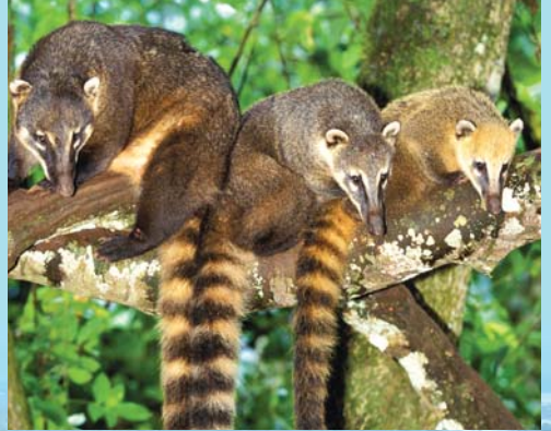
Look for bands of the South American coati, a member of the raccoon family, eating fruit high in the canopy.

This evening, take a special nighttime excursion into the Pacaya-Samiria National Reserve in search of elusive nocturnal creatures such as caimans and bats, and admire the vast blanket of stars that seem to shine brightest here, close to the Equator.