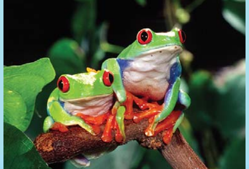
Vibrant red-eyed tree frogs use startle coloration to defend against predators.

species like the colorful large-billed toucan, pink river dolphins, and the South American oriole. Look for a three-toed sloth moving between trees in a slow-motion ballet, while hawks, kites and turkey vultures glide overhead and jabiru storks methodically search for food in the shallows.