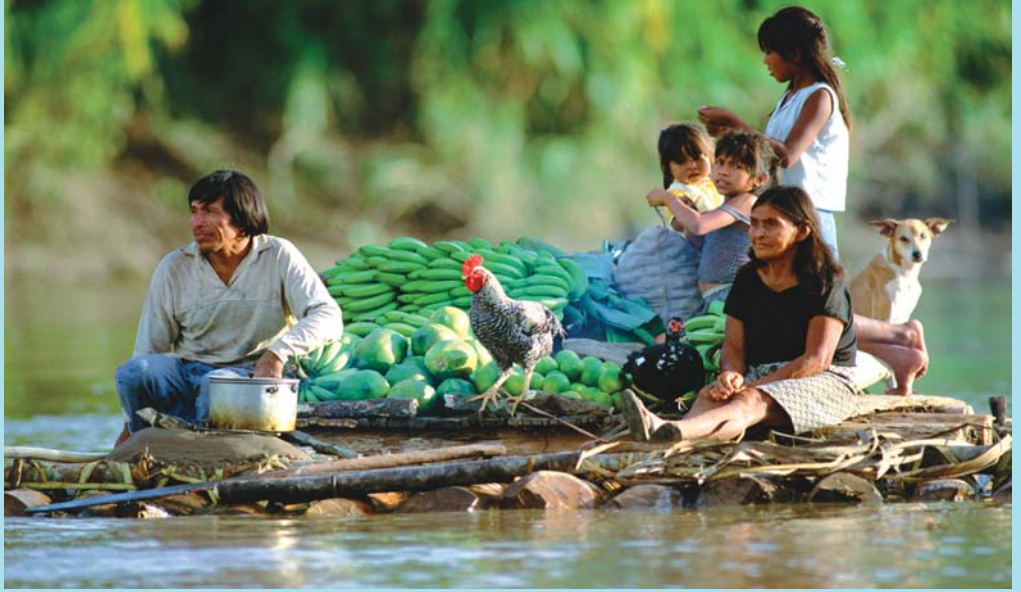
Cruising along the Amazon River provides fascinating opportunities to observe the river's central role in the daily life of the local ribereños, the "river people."

After lunch, board a small river skiff in search of exotic wildlife, including toucans and saddleback tamarin monkeys, and marvel at the giant Victoria amazonica water lilies.