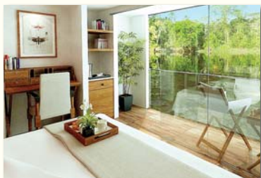
Category A Suite

The M.V. ZAFIRO features a specially designed, spacious open-air Observation Deck offering scenic views by day, spectacular stargazing at night and a full bar and lounge. Public areas also include an indoor reading lounge, fitness room and massage room. The vessel is equipped with small excursion boats ideal for shore visits into the most remote reaches of the Upper Amazon.