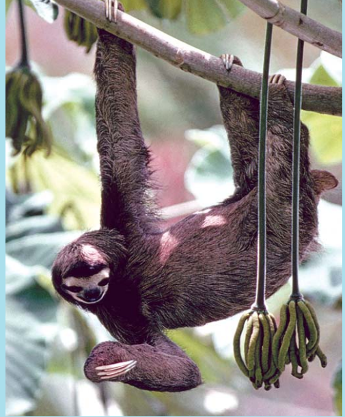
Observe mysterious creatures like the three-toed sloth in their untamed and exotic natural habitat.

Early this afternoon, leave the modern world behind as you begin your voyage of discovery into one of the world's most remote regions. Gather on the ship's observation deck and watch as civilization fades away and the vast Amazon River unfolds before you.