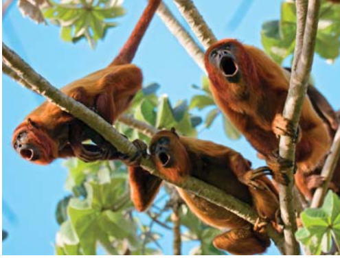
Listen for the throaty call of the howler monkey, one of the Amazon's most commonly sighted species.