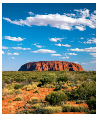
Aboriginal site of Uluru (Ayers Rock)

Day 14: Christchurch/Mt. Cook National Park This morning's orientation tour features the acclaimed Botanic Gardens and "Re:START Mall," the vibrant civic area that rose from the rubble of the 2011 earthquake. Then we board our motorcoach for the journey south to Mt. Cook National Park, stopping en route at a farm to watch a sheep-shearing demonstration and to see the amazing sheep dogs in action. Upon reaching Mt. Cook in the Southern Alps late today, we dine at our hotel. B,D