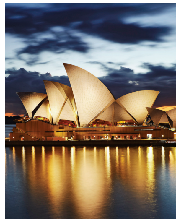
Sydney's iconic Opera House, which we tour on Day 13.