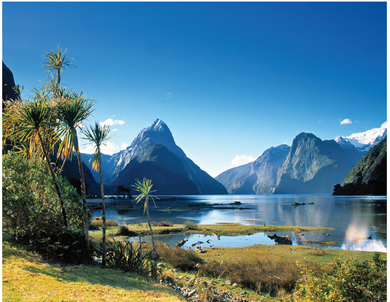
On Day 17, we see for ourselves why serene Milford Sound ranks as New Zealand’s most popular destination.