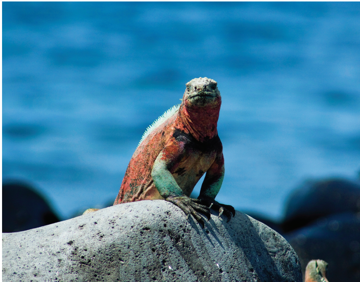
We're sure to encounter plenty of wildlife in the Galapagos, like this curious iguana.