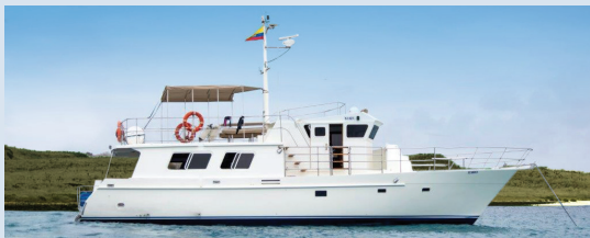
We stay in comfort for four nights in spacious rooms at the Royal Palm Hotel, set in the lush highlands of Santa Cruz island, and enjoy day cruises aboard the Santa Fe, our privately chartered yacht.